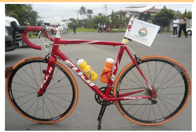
A sports bicycle flagged for a race during the NEGG 2013 cycling competition. All the bicycles that were used for the race were flagged.